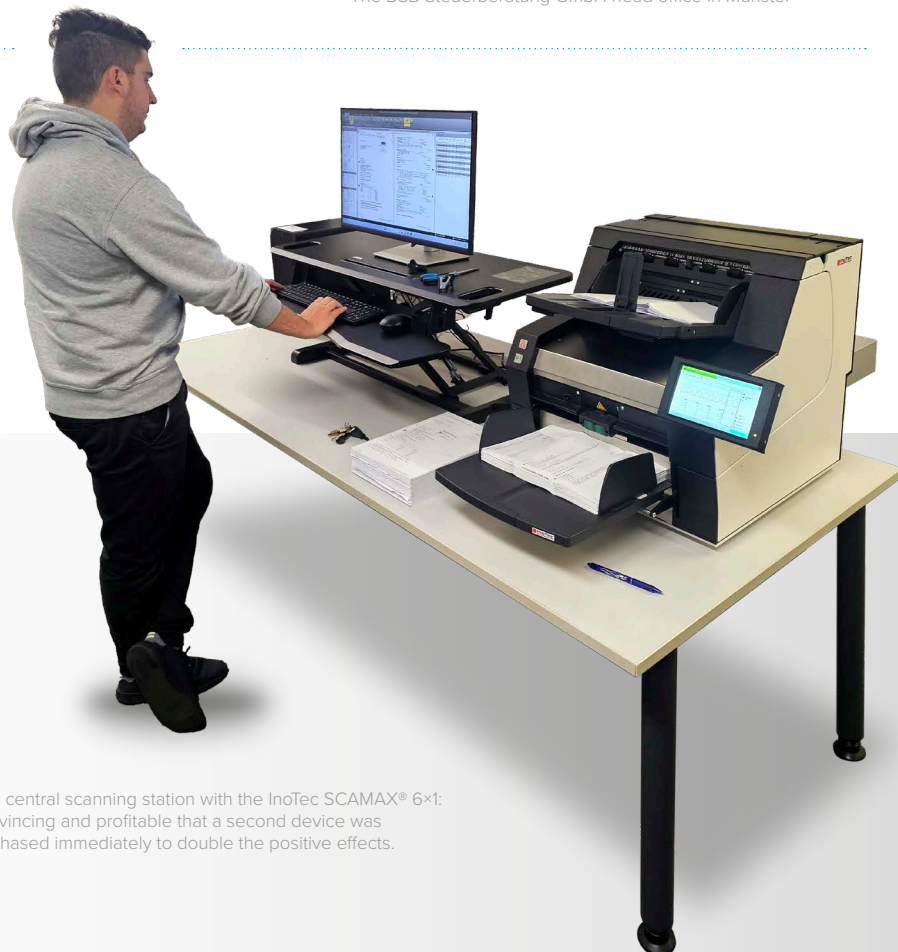
The new central scanning station with the InoTec SCAMAX® 6x1: so convincing and profitable that a second device was purchased immediately to double the positive effects.

In accordance with the 10-year retention obligation, the documents are then filed, expanding a file inventory of over 250,000 full folders with documents from 1960 to the present day on a daily basis. This file inventory extends across all offices and occupies expensive office space.