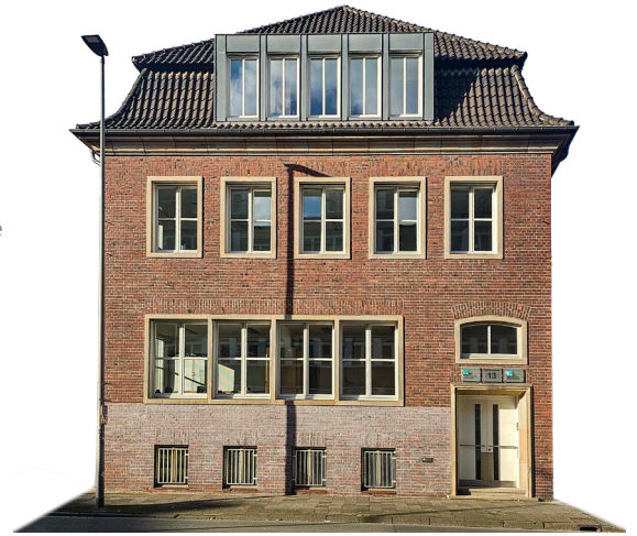
The BSB Steuerberatung GmbH head office in Münster